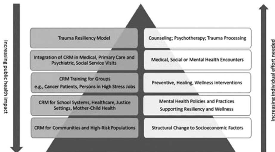
b) The Health Impact Pyramid with categories of mental health interventions (right) and examples of CRM and TRM (left)